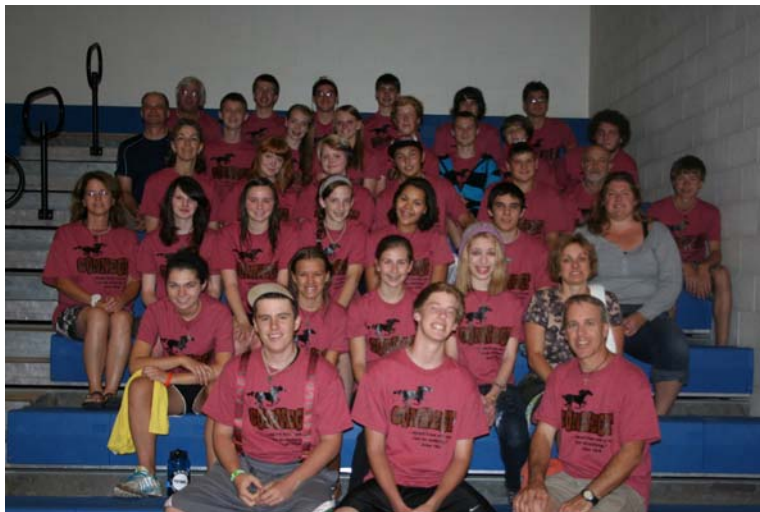
Busby, Montana 2011

For more information: www.groupworkcamps.com